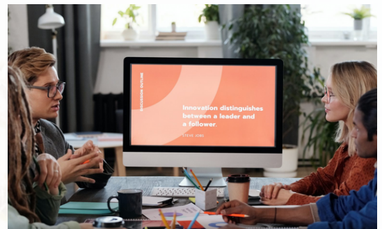
'Culture Fit' Is a Myth and Here's Why