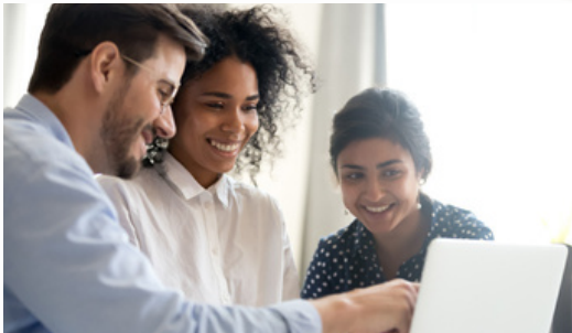
10 Amazing Company Culture Consultants You Should Hire Right Now