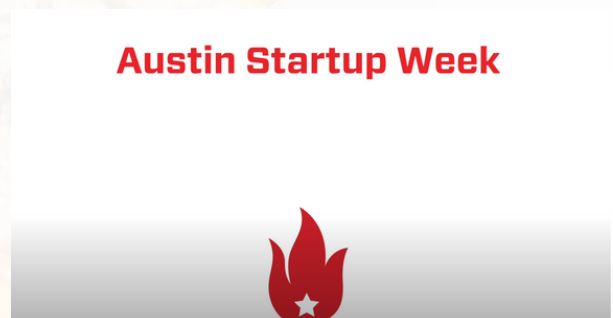
Austin Startup Week: Humanity in the Workplace: Culture & Tribe